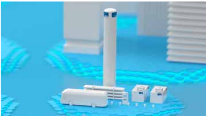
Cryo Pump technology enabling large, efficient bus depots