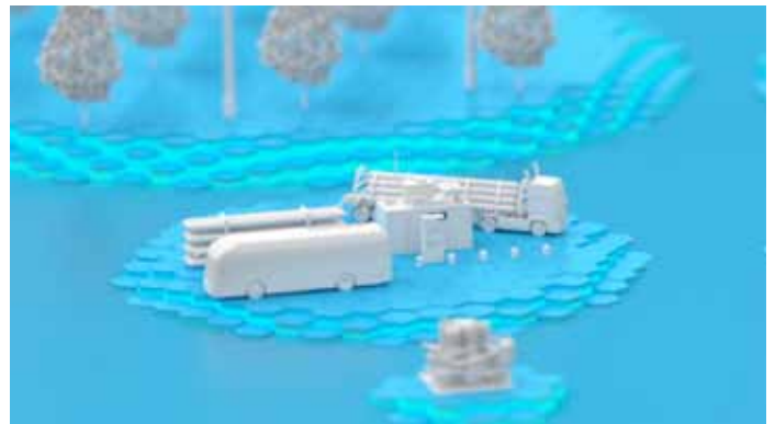
Ionic Compressor for highly efficient trailer-supplied refueling stations