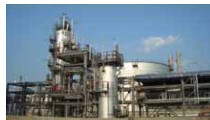
10 m 3 /hr spent caustic treatment plant for IOCL, Vadodara Refinery, India