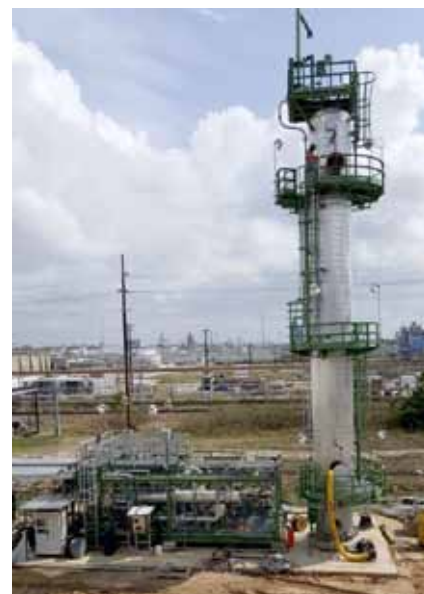
3 m 3 /hr spent caustic treatment plant for Indorama ventures Olefins LLC, Louisiana, USA

Options for low and medium pressures processes